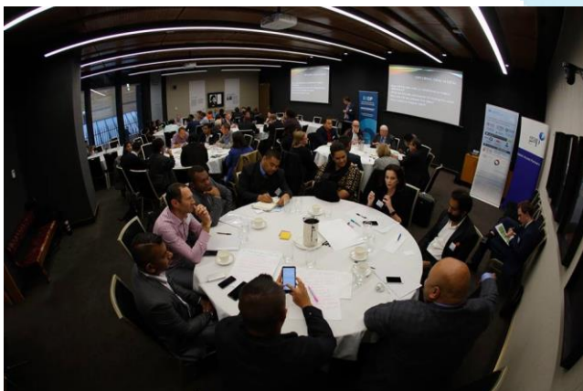
PCC meet at the 2019 Annual Ideas Exchange - Sydney

It is envisaged that the Pacific Connect Community will influence the activities of the Pacific Connect Program through Hub Coordinators & activities.