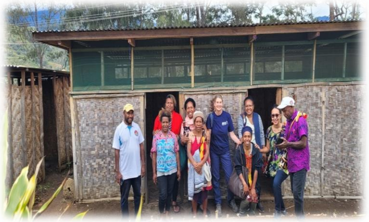
Top Left: Traditional Waiting Hut near a health facility in Daulo Pass, Eastern Highlands, Papua New Guinea. First in Daulo District. Top Right: Semi-permanent Waiting Hut near a rural health facility in Unggai-Bena District, Eastern Highlands Province, Papua New Guinea. Built with Australian Government funding through PNG-Australian Awards Alumni Grants Scheme. Note: The Waiting Hut Inc. supported these shelters with solar lighting, baby bundles, and food rations, in collaboration with the Eastern Highlands Provincial Health Authority.