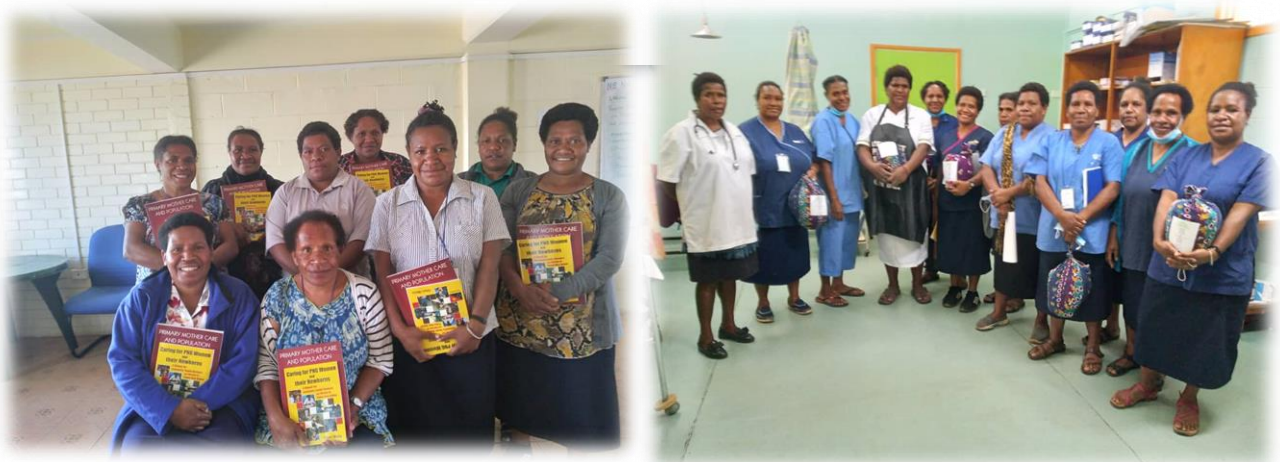
Pictured above: Conduct Training for Health Workers in rural Health facilities ~Up-skilling local Community Health Workers from rural health facilities in EHP. Some capacity building programs are done in partnership with the local Provincial Health Authority.

Pictured bottom right: The Fathers were the first to assist The Waiting Hut Inc. to build the Waiting Hut near this rural health facility. Bottom left: Members of MAF UK who funded Solar Lighting Kits for 21 locations in Eastern Highlands Province, posed with the Executives of the Managing Authority of TWH Inc., on their visit to two (2) of the Waiting Huts in EHP, i.e., Yamiufa in Daulo District, and Sigerehe in Unggai-Bena District. The monies received from MAF UK were used for the Mothers Solar Lighting Project, a Partnership between MAF Technologies, Eastern Highlands Provincial Health Authority, SoundHouse Consulting, and The Waiting Hut Inc.