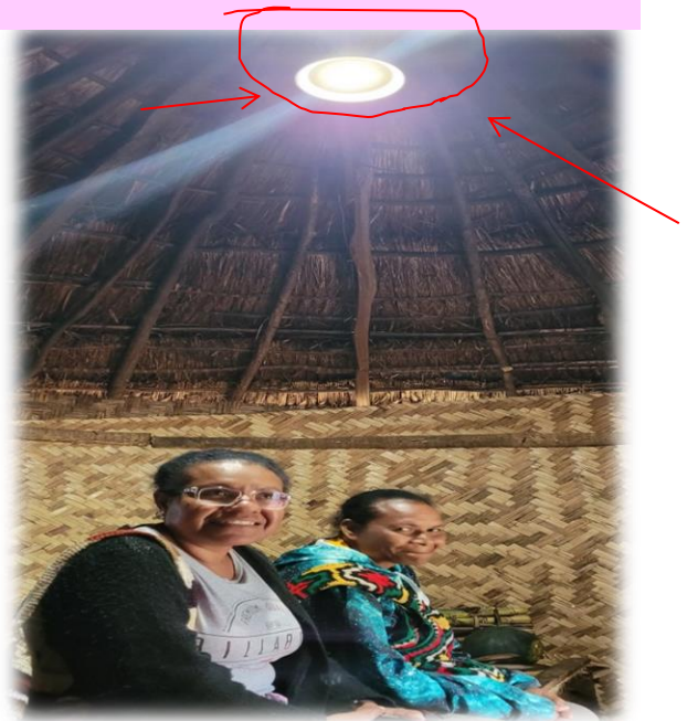
Top right is one of the solar lighting kits installed inside a bush material temporary shelter at near the Yamiufa Sub-health Centre in Daulo District. Top Left: Photos of the first three (3) babies whose mothers gave birth to them using the support The Waiting Hut Inc. provided to the Yamiufa Sub-health Centre.